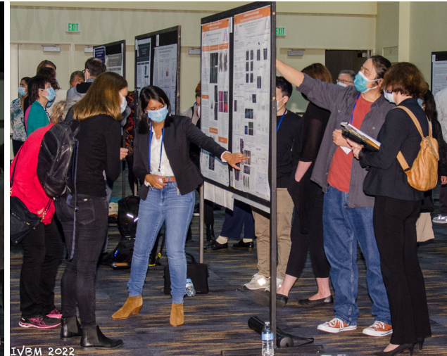
Close to 400 posters were presented over a three day period.