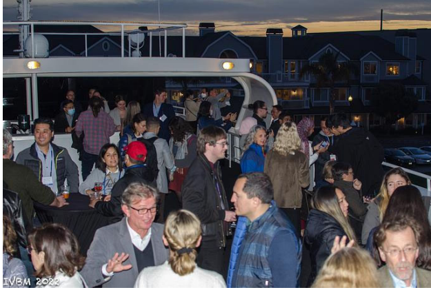
Conversations with new and old colleagues