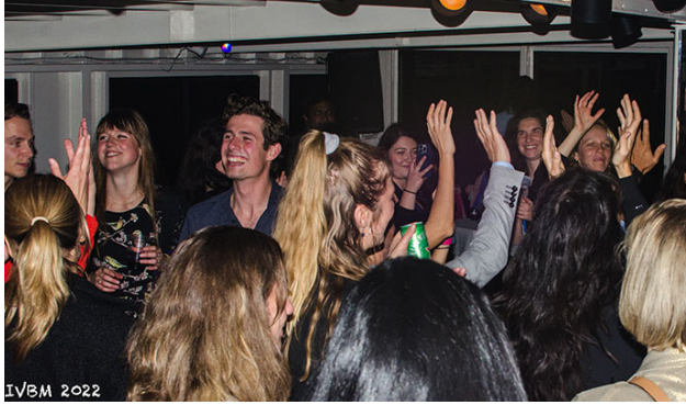
Dancing and a most enjoyable time for all!