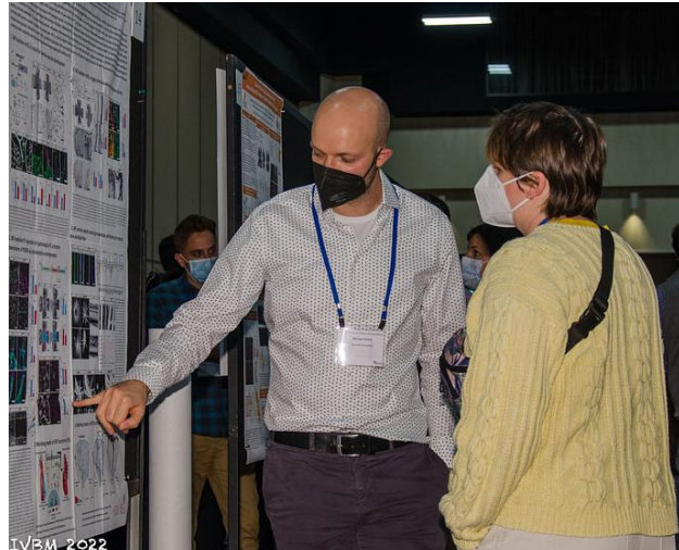
Presenters enjoyed the opportunity to engage with colleagues.