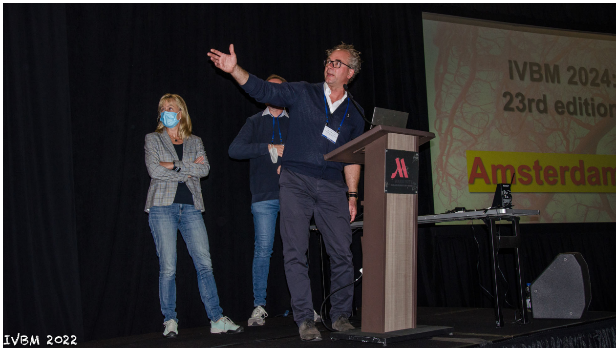
Join us for the 23rd IVBM in Amsterdam!