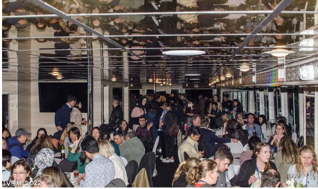
Dinner with friends and collaborators