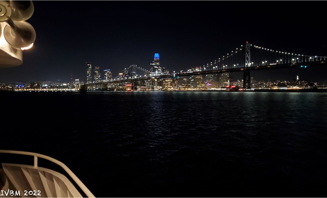
The view of San Francisco from Sunday night's cruise